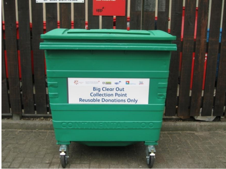
Collection Bin on Loan from NCC

The four collection dates for City and Clifton were designed around the last weekend of the student exam period, the end of term and the end of student contracts at the residences, there were however pick-ups when needed in between these set dates. As a result of the campus size it was practical to liaise with the Accommodation Co-ordinator at Brackenhurst with regards to the frequency of the collections.