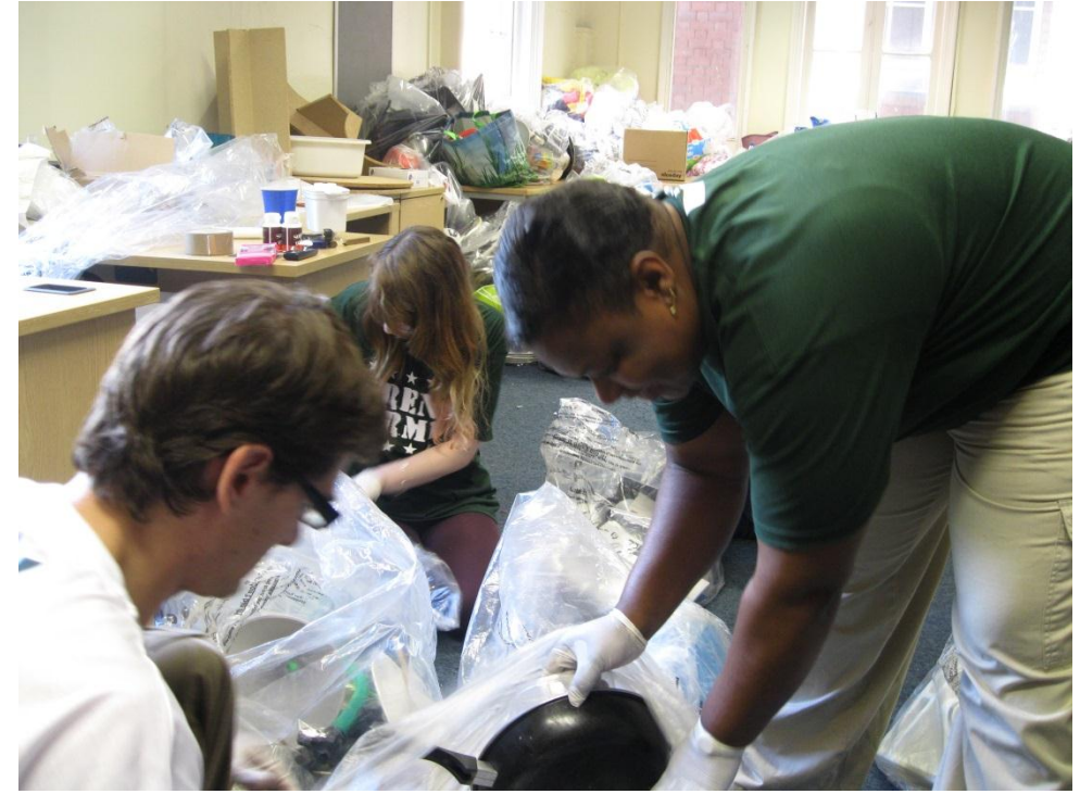
Volunteers Sorting Donations 25/07/2013

All volunteers were provided with a packed lunch for the day.